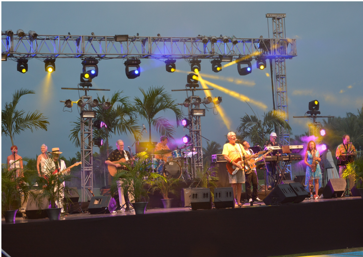
ADVENTURES IN PARROTDISE A Tribute to Jimmy Buffett